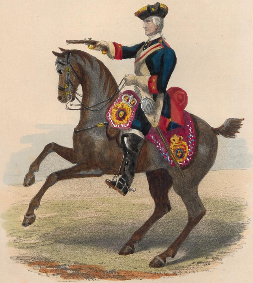
ROYAL REGT OF HORSE GUARDS. 1742.