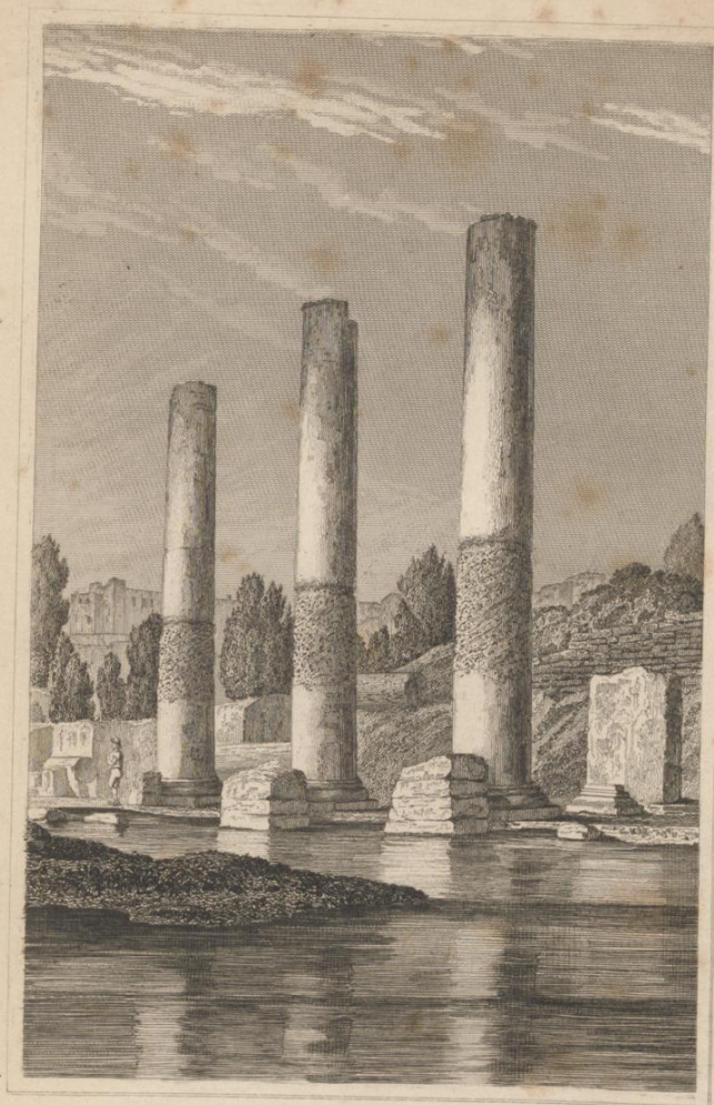
Present state of the Temple of Serapis at Pozzuoli.